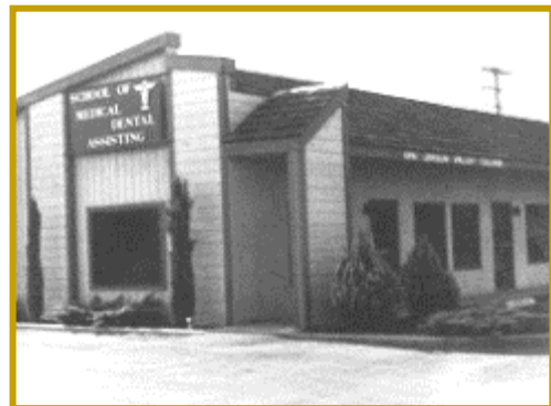
The first SJVC Campus in Visalia, CA

Adopted by the Board of Directors, September 2009